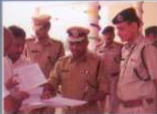
Map under study before approval

was only 6% which has now increased to 12% with dedicated efforts put into by H.P.H.C. The national housing satisfaction level is 30% which is much above 12% satisfaction level in Haryana, thus a lot is yet required to be done in the coming years to achieve that level. Since 1989, the Corporation has progressed leaps & bounds and has made a way in every nook & corner of the State for up keeping of old residential as well as non residential buildings alongwith construction of new houses and training complexes.