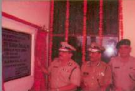
P.S. Matloda , Inauguration by DGP, Shri R S Dalal, IPS.

Our Xens are looking after the prestigious projects of police department and endeavor to complete the projects within the given time frame.