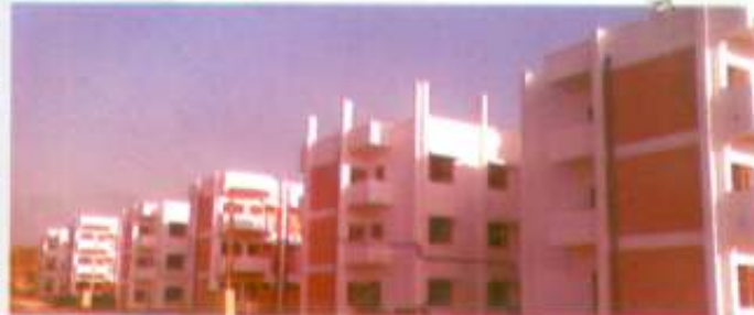
84 Houses, Type IV, in Police Lines, Panchkula

To make your houses beautiful, please tend to the GARDEN and green patch.