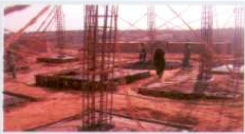
Progress of work at Sunaria

The Superintendent of Police of the district, Shri. — had also organized a Hawan on the occasion and the participants shared a cup of tea after the event.