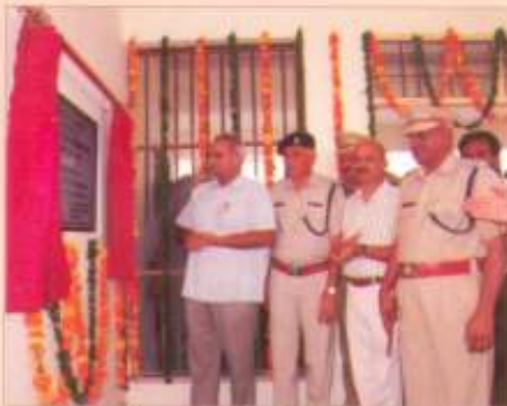
Inauguration of Bapoli P. S., District Panipat

HELP US TO SERVE YOU BETTER—AVOID FREQUENT