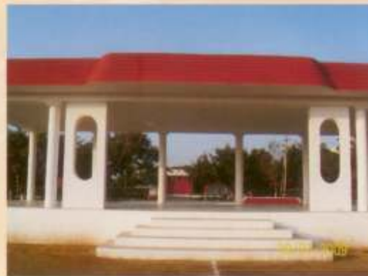
Stage at Police Lines, Hisar

KEEP YOUR HOME CLEAN CLEANLINESS IS NEXT TO GODLINESS.