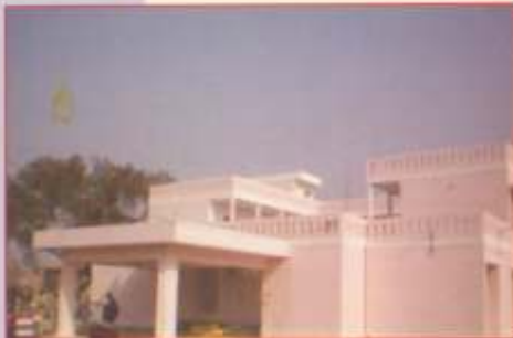
Police Station Saran, Distt. Faridabad