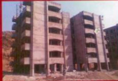
Flats coming up at Moginand, Panchkula, Police Lines.

Our object is to deliver the best to the client.