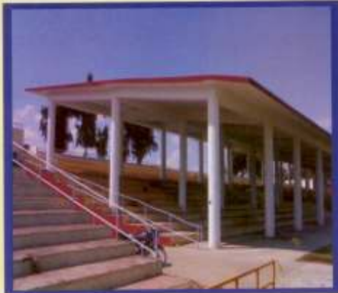
Stadium at Madhuban

Our website : http://mdhphc.googlepages.com