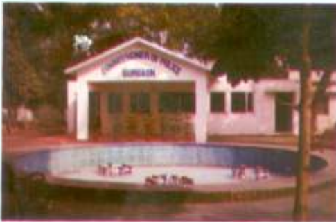
Commissioner of Police Gurgaon Office