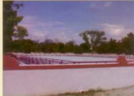
Skating Rink, Madhuban

PLACE GARBAGE BINS WHERE EVER NEEDED AND ASK THE PEOPLE TO USE THEM. KEEP YOUR AREA CLEAN.