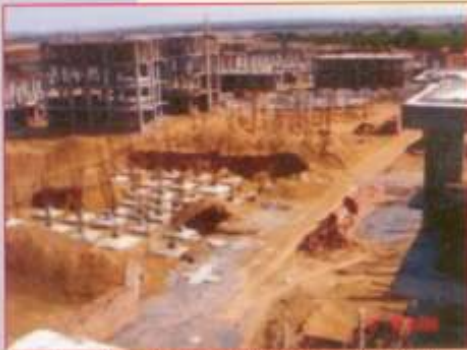
Construction of houses at Police Training Centre Sunarian (Rohtak)